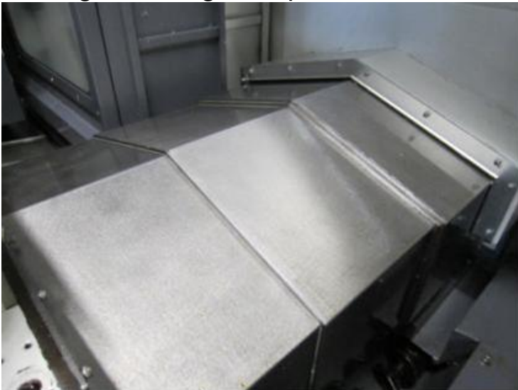
The big slant angle for protect cover